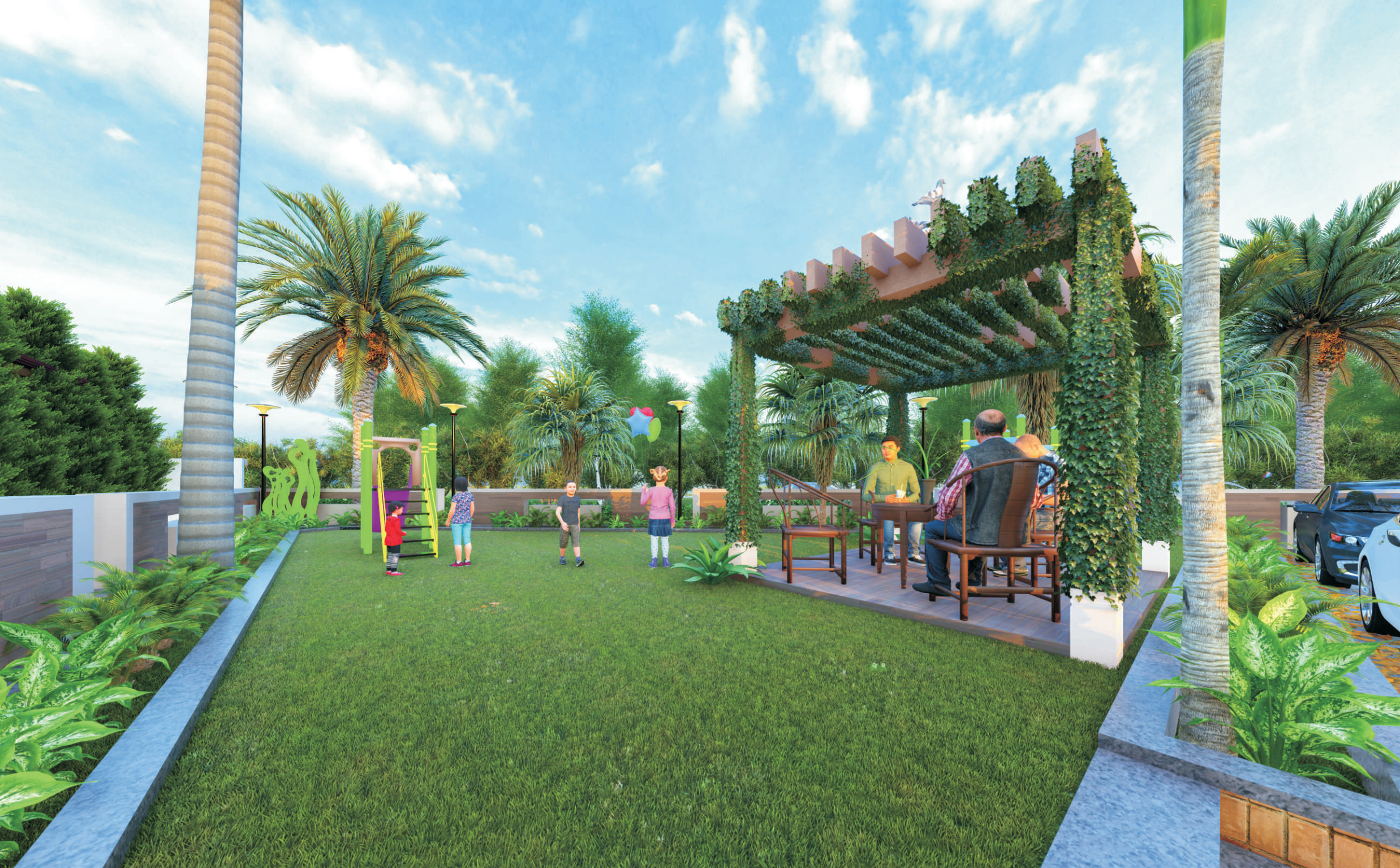
Common Plot & Children Play Area