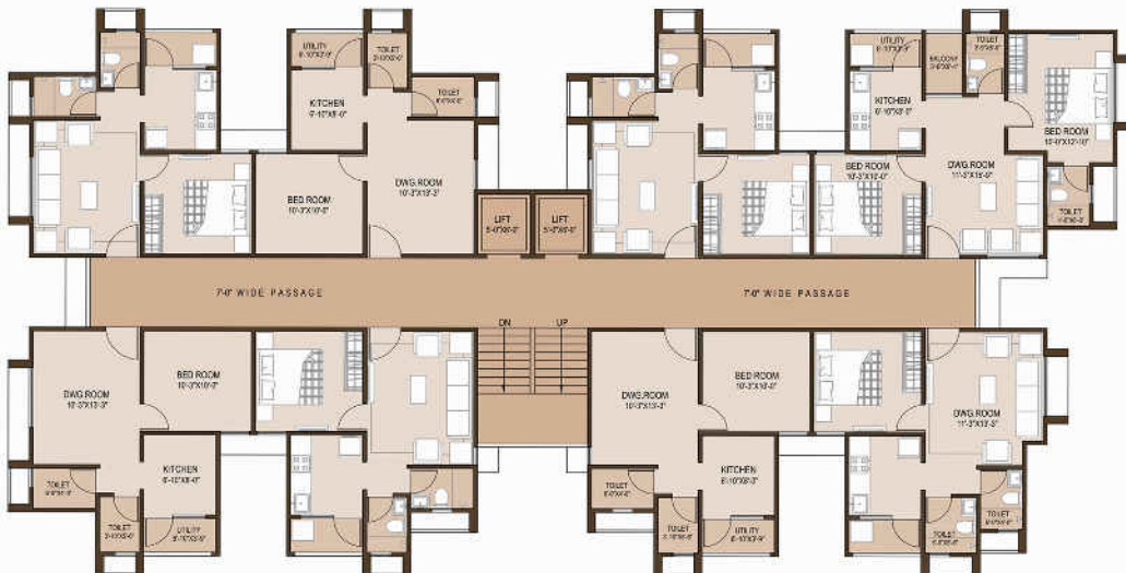
TYPICAL FLOOR PLAN- (BLOCK-C)