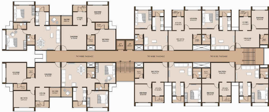
TYPICAL FLOOR PLAN- (BLOCK-E)