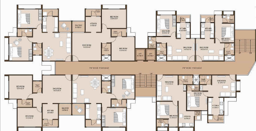
TYPICAL FLOOR PLAN- (BLOCK-D)