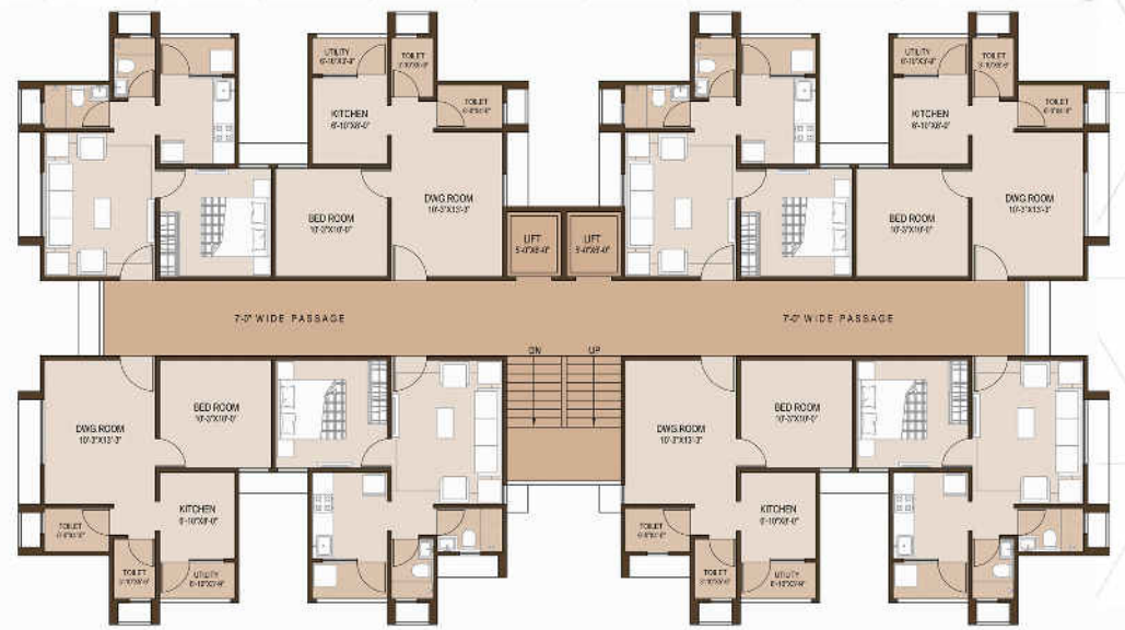
TYPICAL FLOOR PLAN- (BLOCK-B)