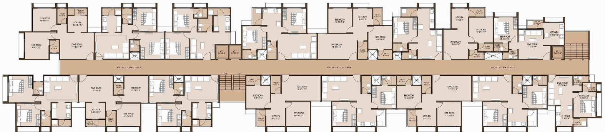
TYPICAL FLOOR PLAN- (BLOCK-F+G)